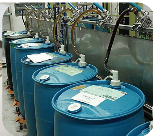
Figure 9: After