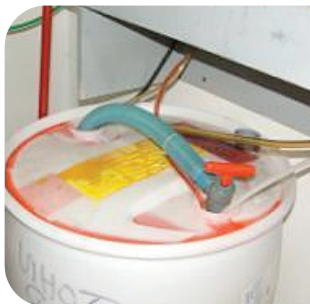
Figure 9: Before