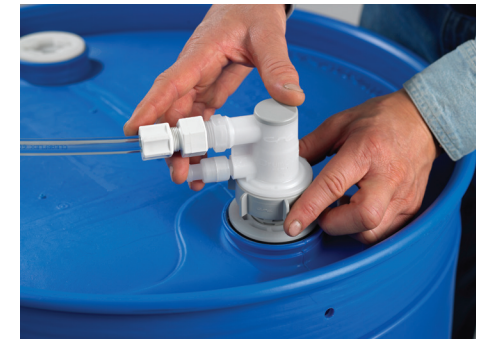
3. Turn the coupler locking ring clockwise until stop is reached (approximately 2 full turns); valve is opened during this process.