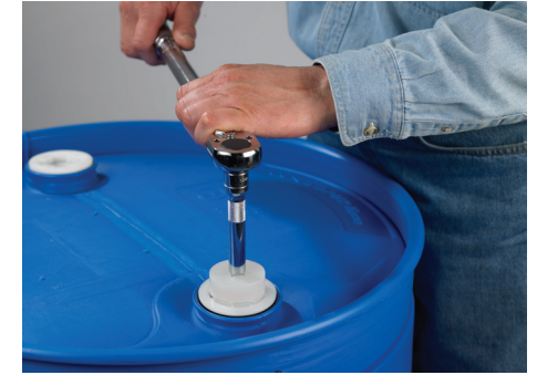
3. Torque insert with drum wrench or 1/2" drive torque wrench and a CPC torque socket tool (CPC PN 2408900).

NOTE: Contact CPC for torque recommendations.