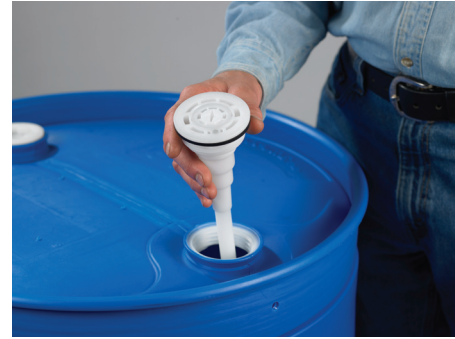
2. Place the drum insert assembly in drum.