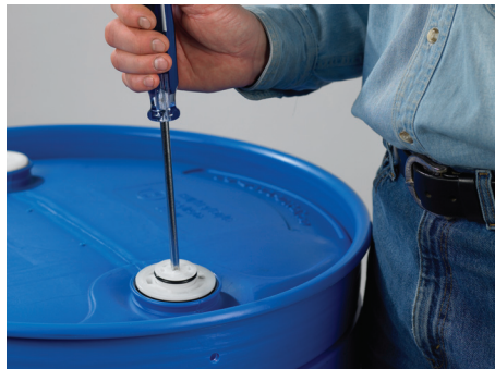
1. Turn shipping plug counterclockwise to remove. Use a large flat blade, #4 Phillips screwdriver or coin.)

Remove the shipping plug from the drum insert assembly, then connect the DrumQuik PRO coupler, locking it into place.