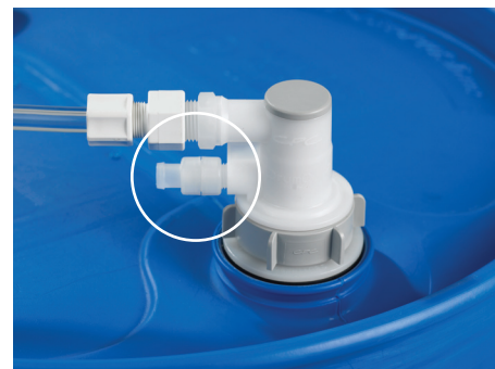
2. Vent port outfitted with CPC check valve.