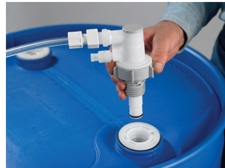
2. Insert coupler into drum insert assembly.