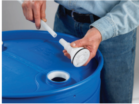
1. Fully press dip-tube into drum insert socket.

The DrumQuik® PRO drum insert assembly replaces one of the drum's bung plugs and is torqued and shipped as part of the drum package.