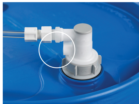
1. Vent port fully open.